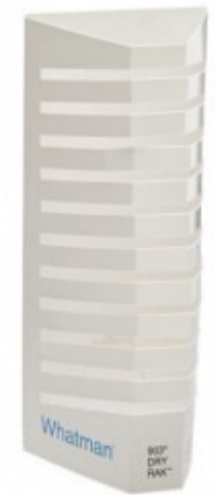
Drying rack (1)