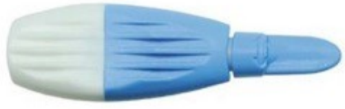
BD, blue lancet (1)