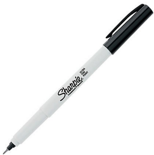
Ultrafine Permanent Marker (1)