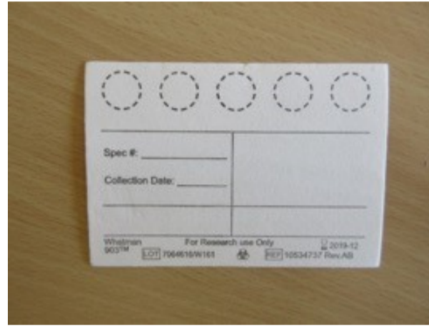
Whatman 903 DBS card (1)