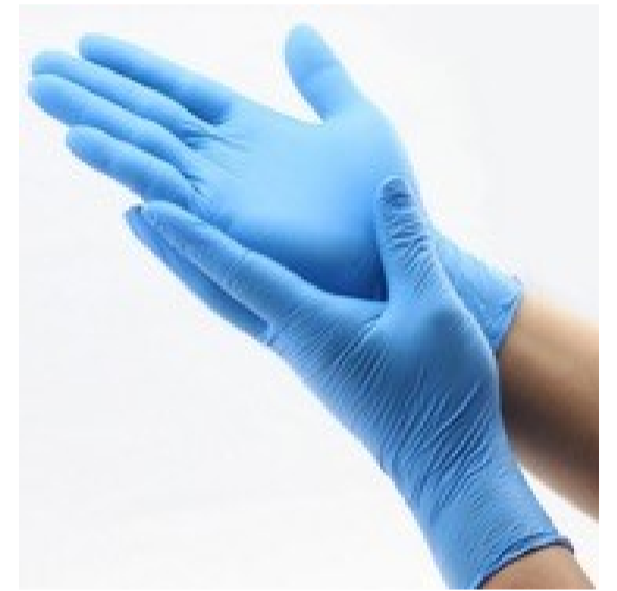
Disposable gloves (2)