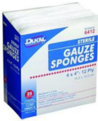
Gauze square (1)