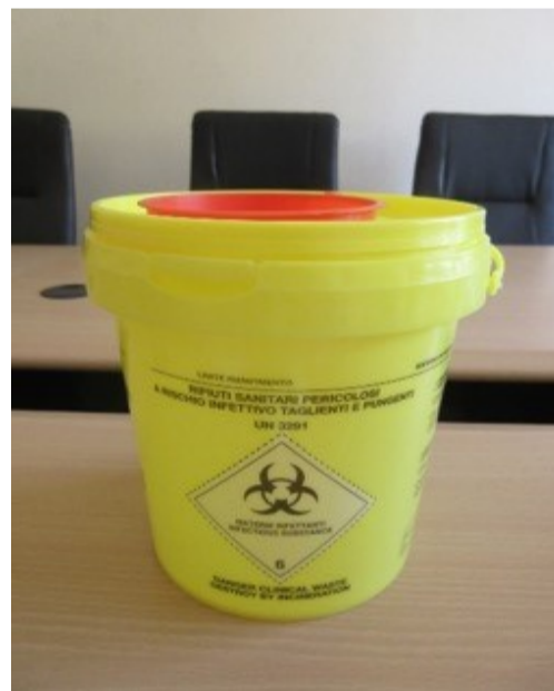
Sharps container (1)