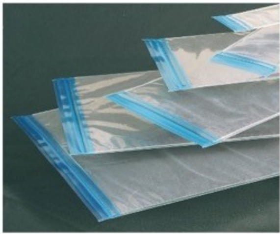
Plastic bag (1)