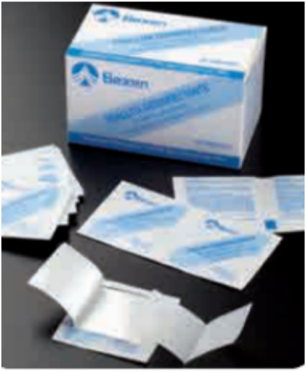
Alcohol swab (1)