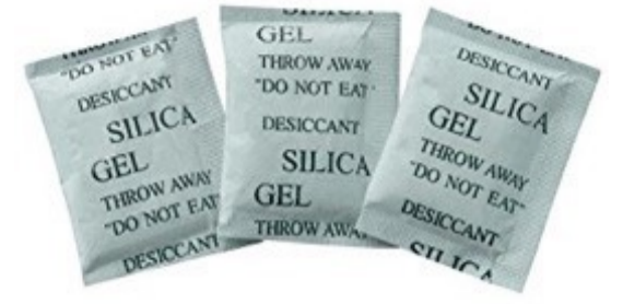
Desiccant packets (3)