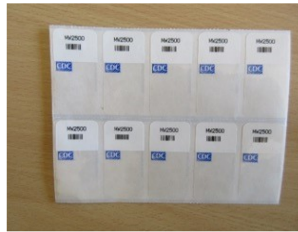
Specimen label (2)